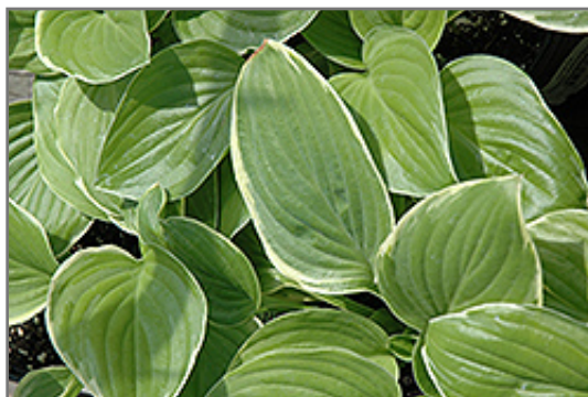
Frozen Margarita Hosta foliage

Frozen Margarita Hosta is recommended for the following landscape applications;