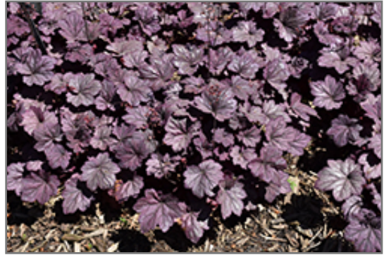
Sugar Plum Coral Bells

Sugar Plum Coral Bells will grow to be about 12 inches tall at maturity extending to 24 inches tall with the flowers, with a spread of 18 inches. When grown in masses or used as a bedding plant, individual plants should be spaced approximately 15 inches apart. Its foliage tends to remain dense right to the ground, not requiring facer plants in front. It grows at a medium rate, and under ideal conditions can be expected to live for approximately 10 years. As an evergreen perennial, this plant will typically keep its form and foliage year-round.