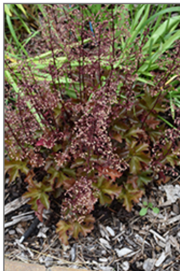
Melting Fire Coral Bells in bloom