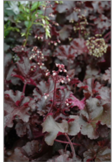
Melting Fire Coral Bells flowers

* This is a 'special order' plant - contact store for details