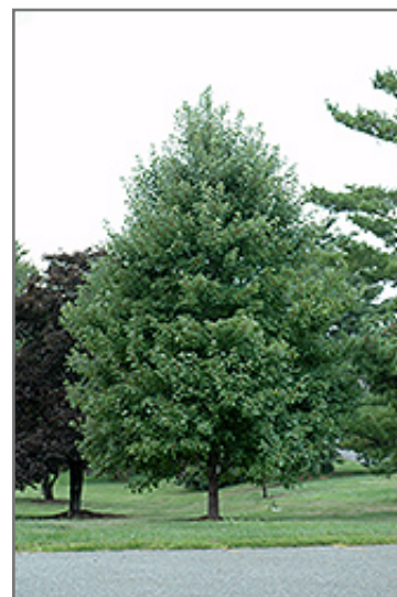
October Glory Red Maple