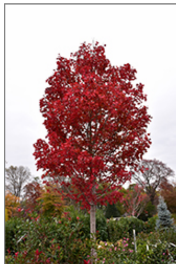
October Glory Red Maple in fall