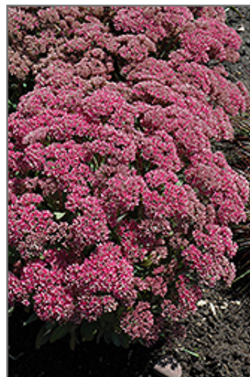
Mr. Goodbud Stonecrop flowers

Mr. Goodbud Stonecrop is recommended for the following landscape applications;