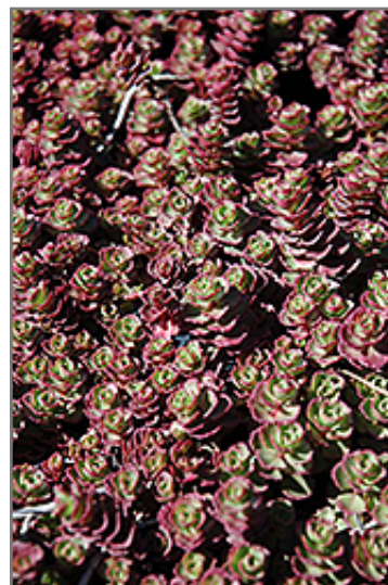
Red Carpet Stonecrop foliage

This plant will require occasional maintenance and upkeep, and is best cleaned up in early spring before it resumes active growth for the season. Deer don't particularly care for this plant and will usually leave it alone in favor of tastier treats. Gardeners should be aware of the following characteristic(s) that may warrant special consideration;