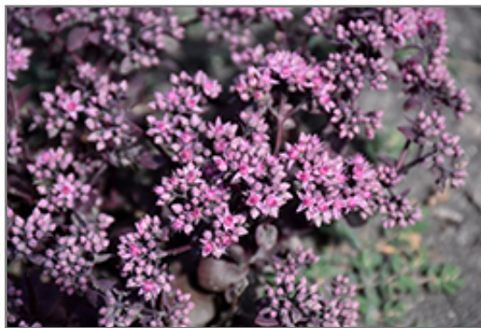
Red Carpet Stonecrop flowers