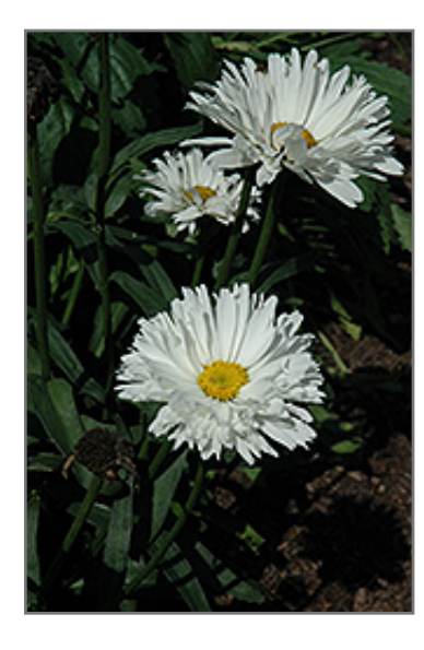
Crazy Daisy Shasta Daisy flowers