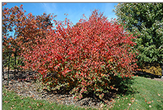
Korean Sun Pear in fall

Korean Sun Pear will grow to be about 15 feet tall at maturity, with a spread of 20 feet. It has a low canopy with a typical clearance of 2 feet from the ground, and is suitable for planting under power lines. It grows at a medium rate, and under ideal conditions can be expected to live for 50 years or more.