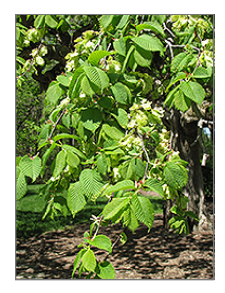
Camperdown Elm foliage