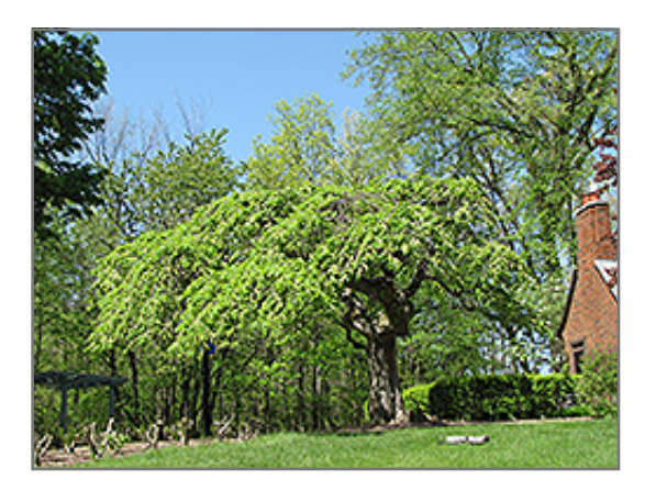
Camperdown Elm

Camperdown Elm is recommended for the following landscape applications;