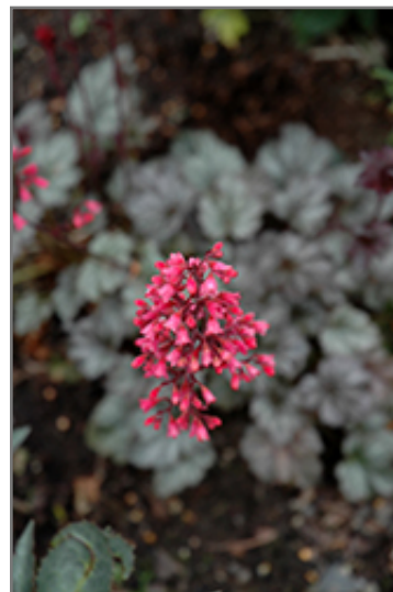
Rave On Coral Bells flowers