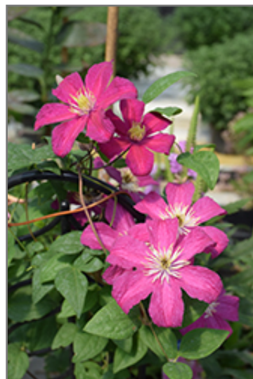
Barbara Harrington Clematis flowers