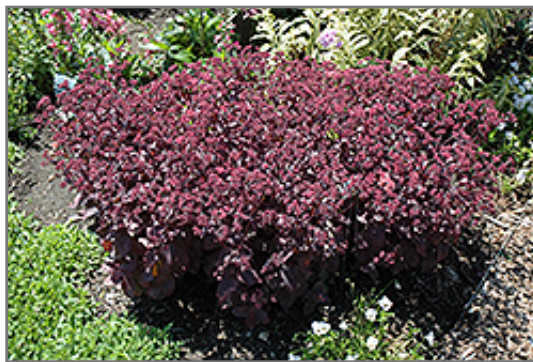
Xenox Stonecrop in bloom