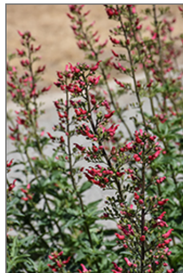
Red Birds In A Tree flowers