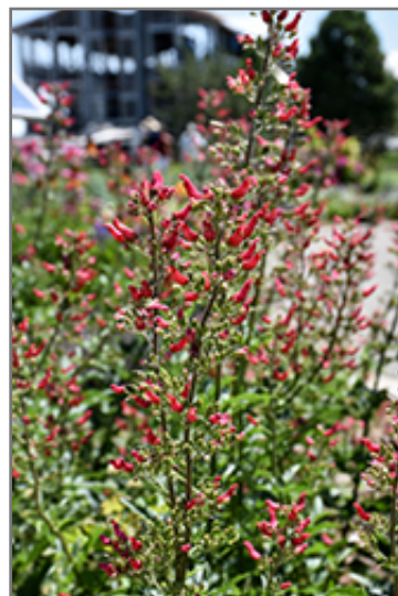
Red Birds In A Tree flowers

Red Birds In A Tree is a fine choice for the garden, but it is also a good selection for planting in outdoor pots and containers. With its upright habit of growth, it is best suited for use as a 'thriller' in the 'spiller-thriller-filler' container combination; plant it near the center of the pot, surrounded by smaller plants and those that spill over the edges. It is even sizeable enough that it can be grown alone in a suitable container. Note that when growing plants in outdoor containers and baskets, they may require more frequent waterings than they would in the yard or garden.