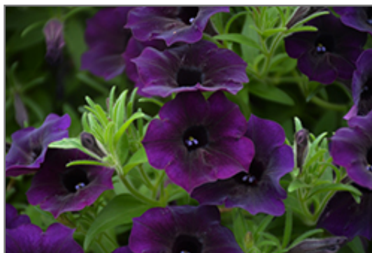
Supertunia Mini Vista Midnight Petunia flowers

This plant will require occasional maintenance and upkeep. Trim off the flower heads after they fade and die to encourage more blooms late into the season. It is a good choice for attracting butterflies and hummingbirds to your yard, but is not particularly attractive to deer who tend to leave it alone in favor of tastier treats. It has no significant negative characteristics.