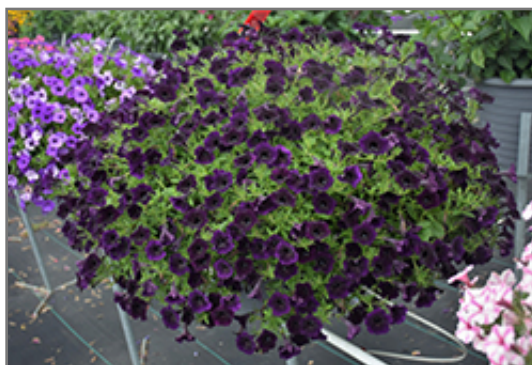
Supertunia Mini Vista Midnight Petunia in bloom