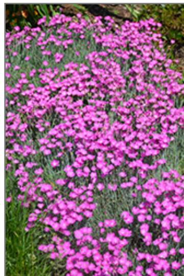
Firewitch Pinks in bloom