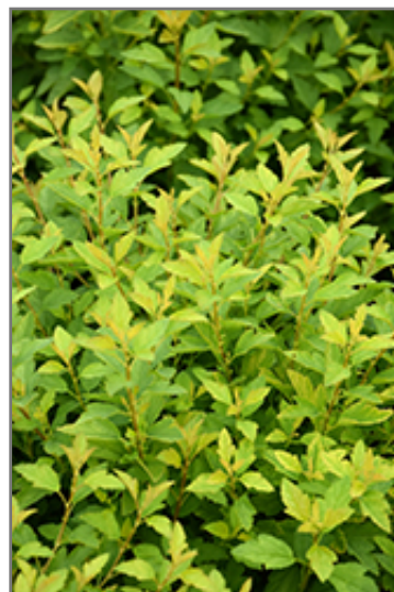
Raspberry Lemonade Ninebark foliage

Raspberry Lemonade Ninebark is recommended for the following landscape applications;