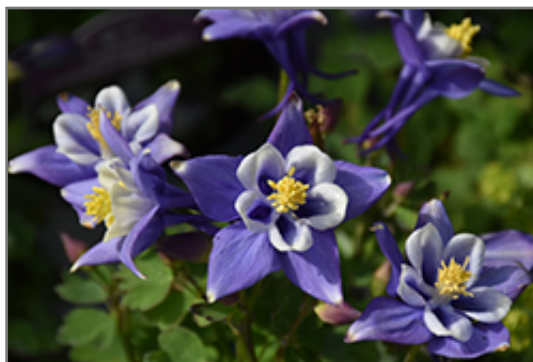
Earlybird Blue and White Columbine flowers