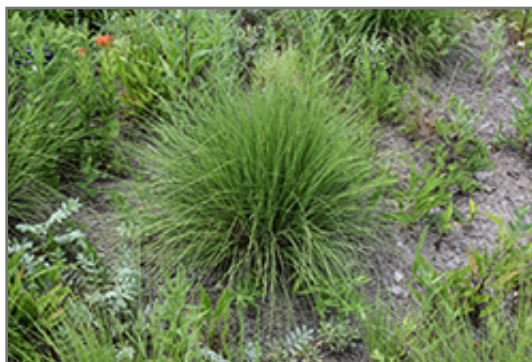
Undaunted Ruby Muhly Grass

Undaunted Ruby Muhly Grass is recommended for the following landscape applications;