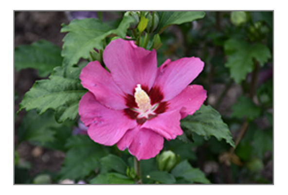
Paraplu Rouge Rose of Sharon flowers

This is a high maintenance shrub that will require regular care and upkeep, and is best pruned in late winter once the threat of extreme cold has passed. It is a good choice for attracting bees, butterflies and hummingbirds to your yard, but is not particularly attractive to deer who tend to leave it alone in favor of tastier treats. Gardeners should be aware of the following characteristic(s) that may warrant special consideration;