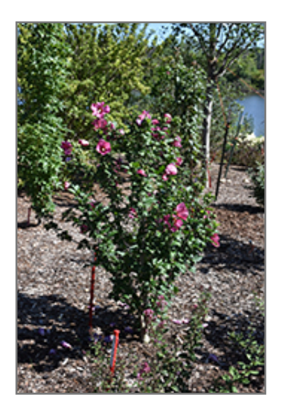
Paraplu Rouge Rose of Sharon in bloom