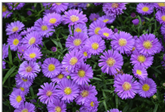
Magic Purple Aster flowers

Magic Purple Aster is recommended for the following landscape applications;