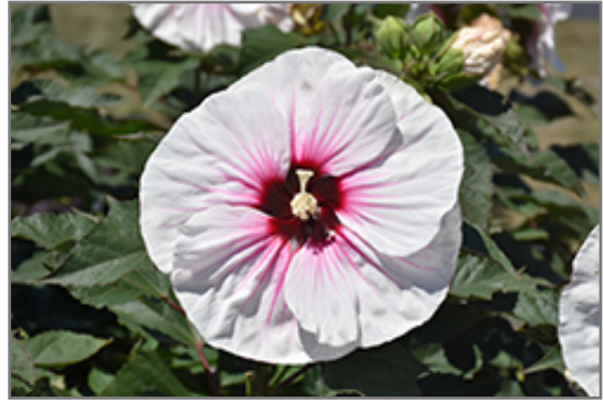
Angel Eyes Hibiscus flowers