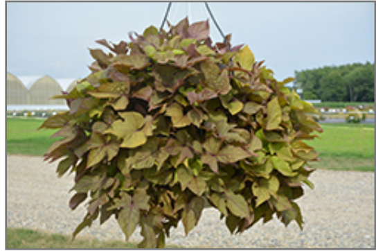
Floramia Verdino Sweet Potato Vine

Floramia Verdino Sweet Potato Vine will grow to be about 8 inches tall at maturity, with a spread of 24 inches. When grown in masses or used as a bedding plant, individual plants should be spaced approximately 20 inches apart. Its foliage tends to remain low and dense right to the ground. This fast-growing annual will normally live for one full growing season, needing replacement the following year.