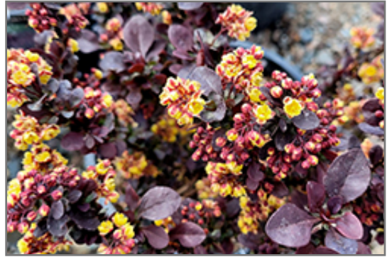
Concorde Japanese Barberry flowers

Concorde Japanese Barberry will grow to be about 18 inches tall at maturity, with a spread of 24 inches. It tends to fill out right to the ground and therefore doesn't necessarily require facer plants in front. It grows at a slow rate, and under ideal conditions can be expected to live for approximately 20 years.