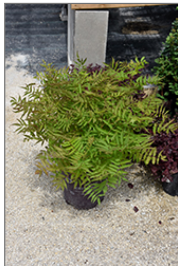
Matcha Ball False Spirea