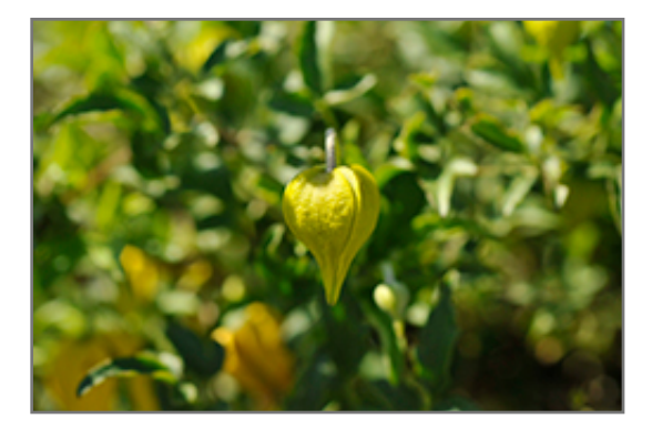
Little Lemons Clematis flower buds