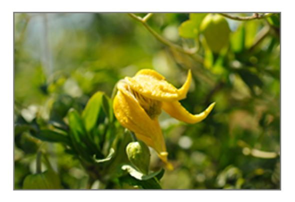
Little Lemons Clematis flowers

Little Lemons Clematis is recommended for the following landscape applications;