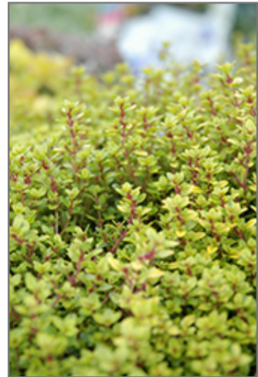
Archer's Gold Thyme flowers