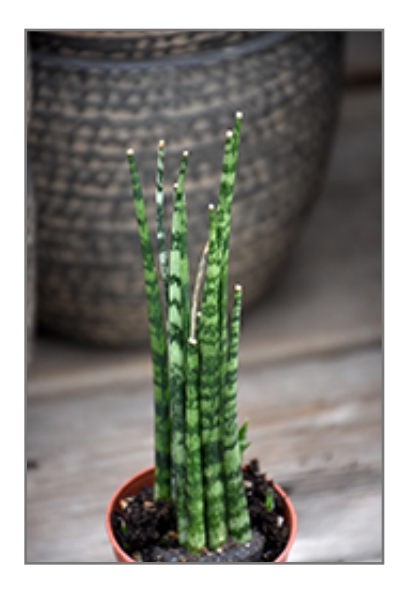
Mikado Cylindrical Snake Plant

When grown indoors, Mikado Cylindrical Snake Plant can be expected to grow to be about 3 feet tall at maturity, with a spread of 18 inches. It grows at a slow rate, and under ideal conditions can be expected to live for approximately 10 years. This houseplant will do well in a location that gets either direct or indirect sunlight, although it will usually require a more brightly-lit environment than what artificial indoor lighting alone can provide. It prefers dry to average moisture levels with very well-drained soil, and may die if left in standing water for any length of time. This plant should be watered when the surface of the soil gets dry, and will need watering approximately once each week. Be aware that your particular watering schedule may vary depending on its location in the room, the pot size, plant size and other conditions; if in doubt, ask one of our experts in the store for advice. It is not particular as to soil pH, but grows best in sandy soil. Contact the store for specific recommendations on pre-mixed potting soil for this plant. Be warned that parts of this plant are known to be toxic to humans and animals, so special care should be exercised if growing it around children and pets.