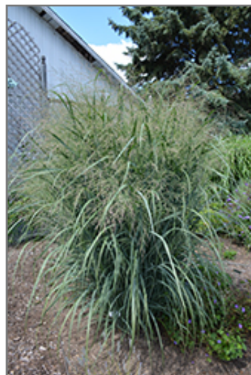
Northwind Switch Grass in bloom

This plant does best in full sun to partial shade. It is very adaptable to both dry and moist locations, and should do just fine under typical garden conditions. It is considered to be drought-tolerant, and thus makes an ideal choice for a low-water garden or xeriscape application. It is not particular as to soil type, but has a definite preference for alkaline soils, and is able to handle environmental salt. It is somewhat tolerant of urban pollution. This is a selection of a native North American species. It can be propagated by division; however, as a cultivated variety, be aware that it may be subject to certain restrictions or prohibitions on propagation.