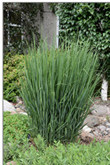
Northwind Switch Grass