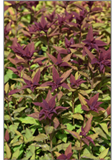
Double Play Doozie Spirea foliage

* This is a 'special order' plant - contact store for details