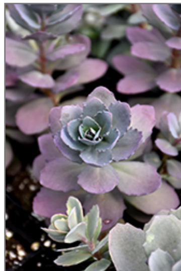
Plum Dazzled Stonecrop foliage