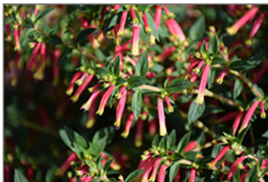
Honeybells Cuphea flowers