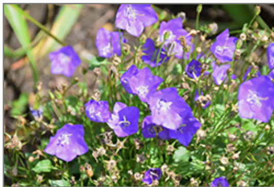
Violet Teacups Bellflower flowers