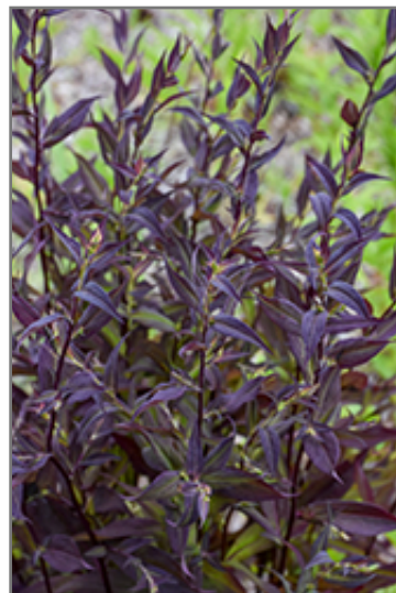
Lady In Black Calico Aster