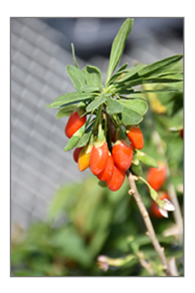
Firecracker Goji Berry flowers

Aside from its primary use as an edible, Firecracker Goji Berry is sutiable for the following landscape applications;