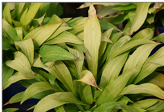
Munchkin Fire Hosta foliage