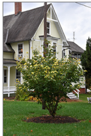
Champion's Gold Chinese Dogwood