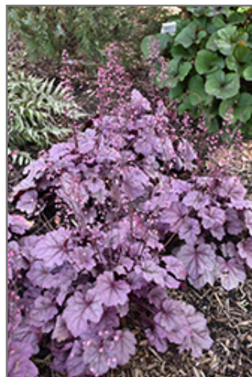
Pink Panther Coral Bells in bloom

Pink Panther Coral Bells is recommended for the following landscape applications;