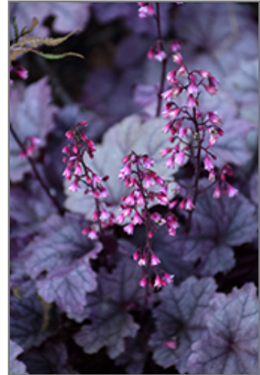
Pink Panther Coral Bells flowers

Pink Panther Coral Bells is a fine choice for the garden, but it is also a good selection for planting in outdoor pots and containers. With its upright habit of growth, it is best suited for use as a 'thriller' in the 'spiller-thriller-filler' container combination; plant it near the center of the pot, surrounded by smaller plants and those that spill over the edges. Note that when growing plants in outdoor containers and baskets, they may require more frequent waterings than they would in the yard or garden.