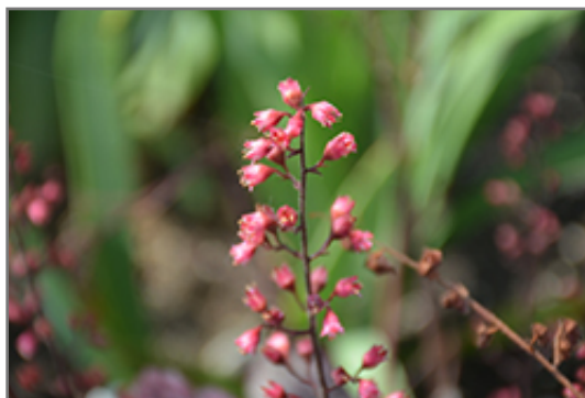
Grape Timeless Coral Bells flowers

Grape Timeless Coral Bells will grow to be about 10 inches tall at maturity extending to 20 inches tall with the flowers, with a spread of 20 inches. When grown in masses or used as a bedding plant, individual plants should be spaced approximately 16 inches apart. Its foliage tends to remain low and dense right to the ground. It grows at a medium rate, and under ideal conditions can be expected to live for approximately 10 years. As an evergreen perennial, this plant will typically keep its form and foliage year-round.