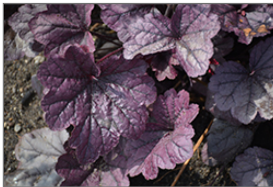
Grape Timeless Coral Bells foliage