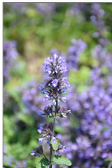
Cat's Pajamas Catmint flowers

Cat's Pajamas Catmint is recommended for the following landscape applications;