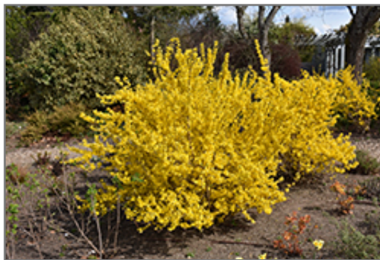
Magical Gold Forsythia in bloom