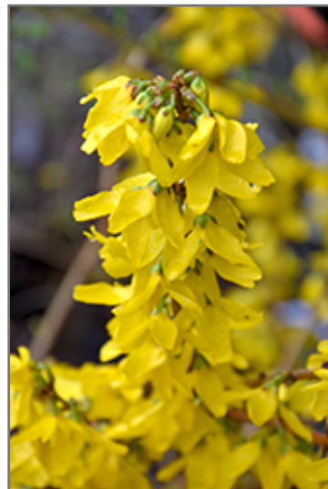
Magical Gold Forsythia flowers

* This is a 'special order' plant - contact store for details