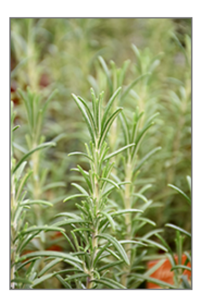
Ingauno Rosemary foliage

Aside from its primary use as an edible, Ingauno Rosemary is sutiable for the following landscape applications;