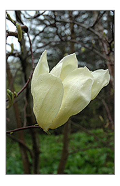
Cucumber Magnolia flowers