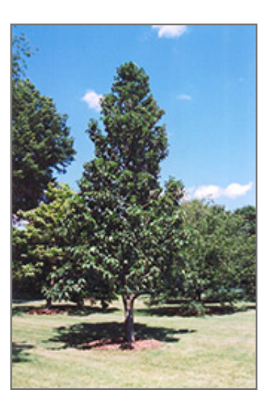
Cucumber Magnolia

* This is a 'special order' plant - contact store for details