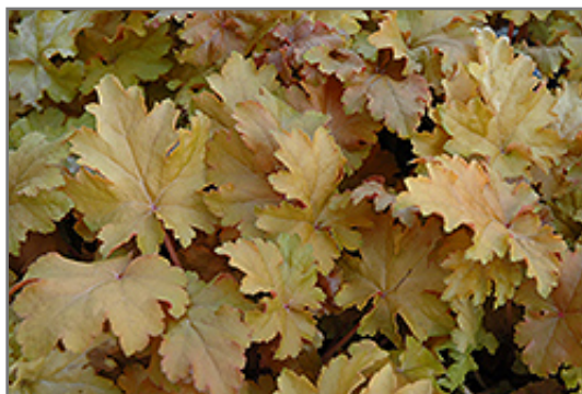
Amber Waves Coral Bells foliage

Amber Waves Coral Bells will grow to be only 6 inches tall at maturity extending to 12 inches tall with the flowers, with a spread of 12 inches. When grown in masses or used as a bedding plant, individual plants should be spaced approximately 10 inches apart. Its foliage tends to remain low and dense right to the ground. It grows at a medium rate, and under ideal conditions can be expected to live for approximately 10 years. As an evergreen perennial, this plant will typically keep its form and foliage year-round.