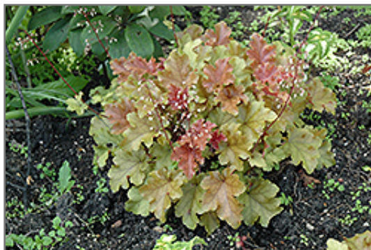
Amber Waves Coral Bells in bloom