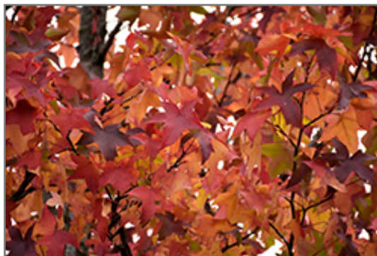
Sweet Gum in fall