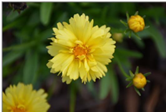
Leading Lady Charlize Tickseed flowers

Leading Lady Charlize Tickseed is recommended for the following landscape applications;