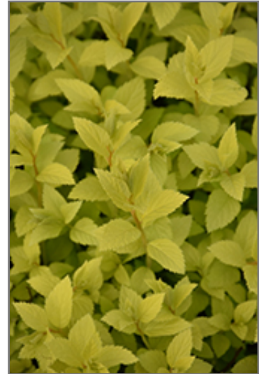
Double Play Gold Spirea foliage

* This is a 'special order' plant - contact store for details