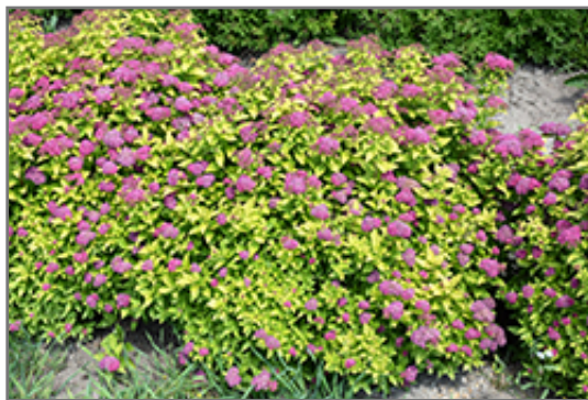
Double Play Gold Spirea in bloom