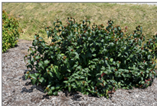
Kodiak Black Diervilla