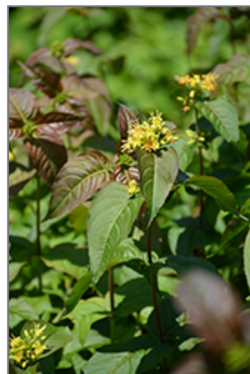
Kodiak Black Diervilla flowers