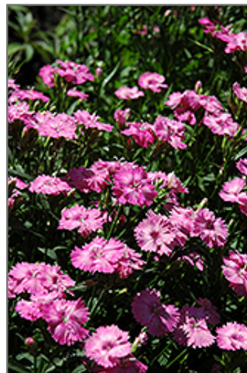
Blue Hills Pinks flowers