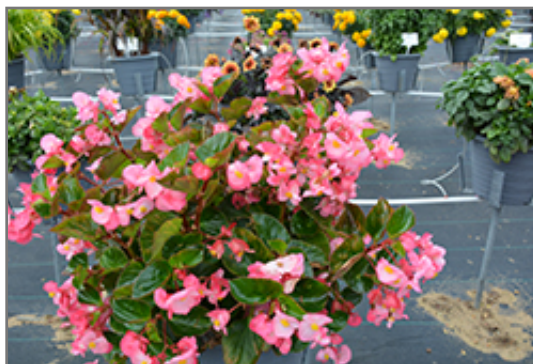
Big Pink Green Leaf Begonia in bloom

Big Pink Green Leaf Begonia is a fine choice for the garden, but it is also a good selection for planting in outdoor containers and hanging baskets. It is often used as a 'filler' in the 'spiller-thriller-filler' container combination, providing a mass of flowers and foliage against which the larger thriller plants stand out. Note that when growing plants in outdoor containers and baskets, they may require more frequent waterings than they would in the yard or garden.