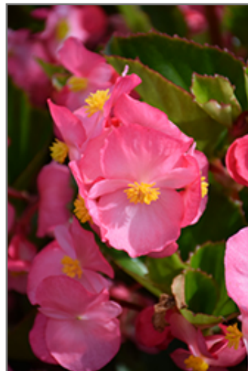
Big Pink Green Leaf Begonia flowers

This is a high maintenance plant that will require regular care and upkeep, and usually looks its best without pruning, although it will tolerate pruning. Deer don't particularly care for this plant and will usually leave it alone in favor of tastier treats. Gardeners should be aware of the following characteristic(s) that may warrant special consideration;