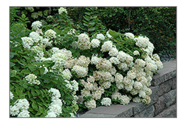
Pee Gee Hydrangea in bloom