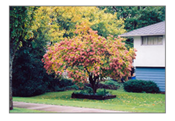
Pee Gee Hydrangea in bloom